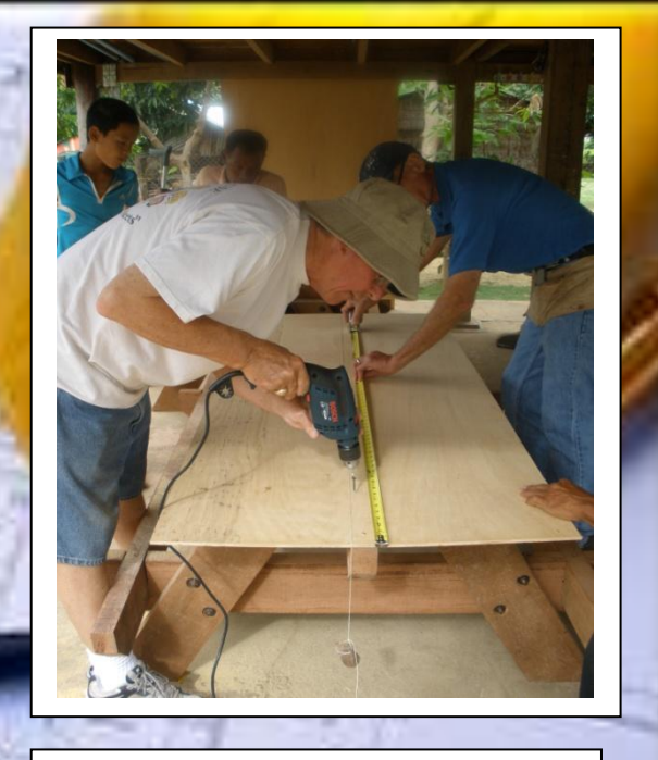
DJD is thankful to University Baptist Fort Worth for providing the funding for the English Camps and construction project and a portion of the team expenses.