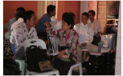
Pastors and leaders working on a small group exercise.

The March training was held on the 23 rd and was attended by 45 pastors and church leaders. In addition to the training, we heard stories of new churches, house churches and Bible study groups have started recently. We heard about 18 new groups. Praise the Lord. God is at work in Cambodia!