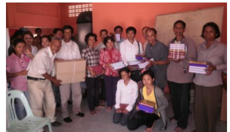
Pastors and leaders receive Bibles and song books.