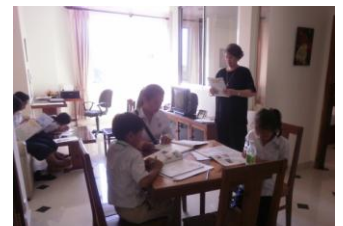
Ten school age children studying in English class.