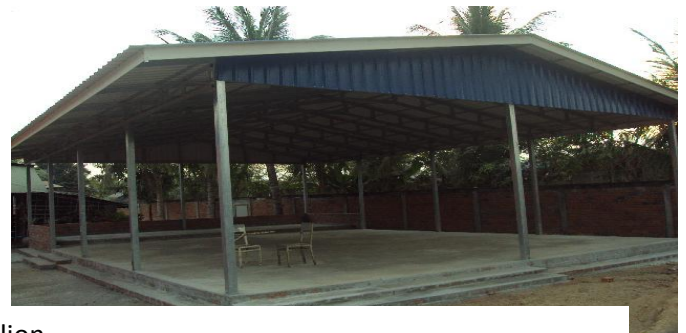
Left: the pavilion that has been replaced. Right: new pavilion